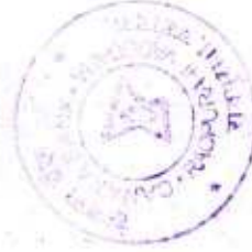
Authorised Officer Canara Bank